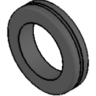
ALL OTHER SIZES

NOTES 1a) METRIC PRIMARY UNITS:mm 1b) IMPERIAL SECONDARY UNITS: [inches] 2) ALL RMS-262 PARTS (UL94-HB) ARE AVAILABLE IN RMS-263 (UL94-V0) BY SPECIAL ORDER